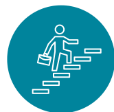
POSTSECONDARY & CAREER READINESS